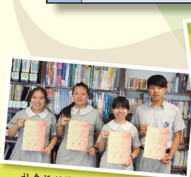
社會福利署義工嘉許狀金獎得主