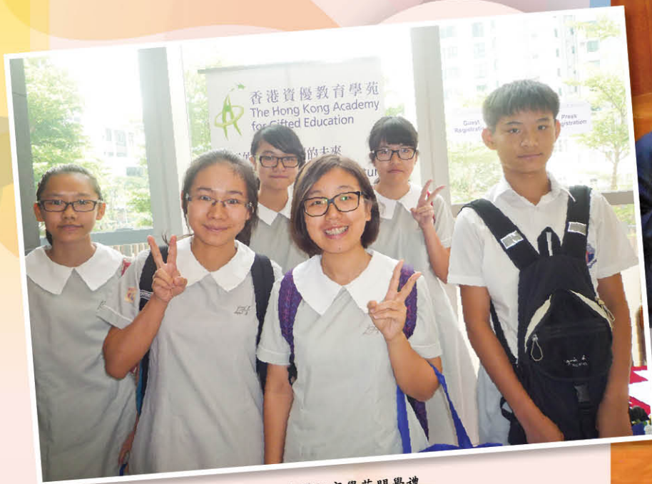
資優教育學苑開學禮

本校深信每位學生皆有其天賦，故定當繼續通過不同類型的學習經歷，為學生提供適切的培訓及更廣闊的發展空間，讓他們盡展潛能。