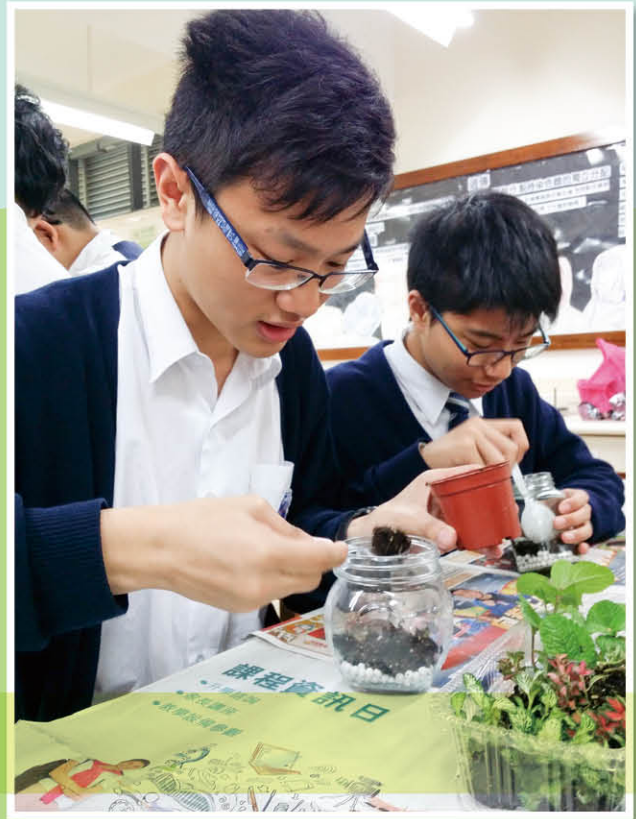
製作環保玻璃盆栽