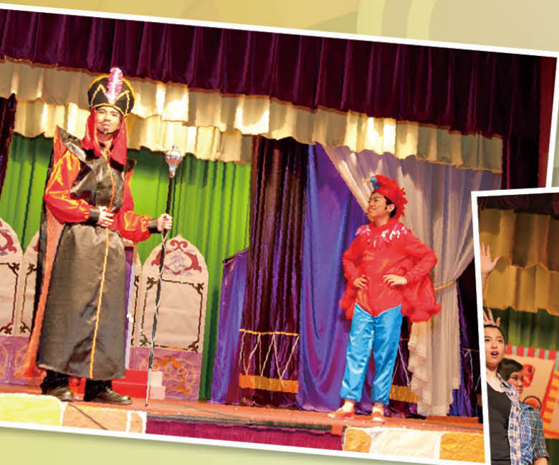
English Musical "Aladdin" and "Footloose"

While the above have helped to strengthen our quality of English teaching, the collaboration among teachers and the effectiveness of English learning of students have also significantly facilitated.