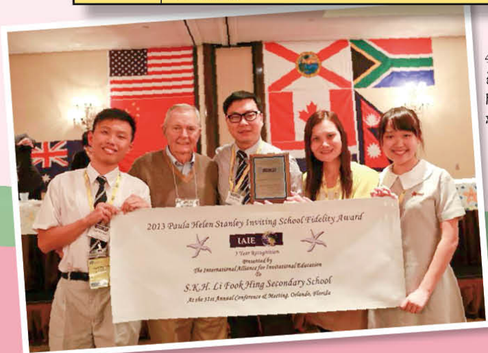
4位師生代表前往美國佛羅里達州領取「2013國際啟發潛能教育學校成就大獎」