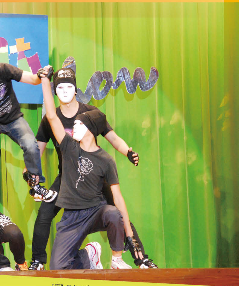
LEH's Talent Show

The Volleyball Team and Athletic Team of our school obtained a lot of awards in interschool competitions. We also stress on leadership training. Captains from five houses joined the 'Leadership Training Certificate Course for House Captains' held by The Hong Kong Federation of Youth Groups. Committee members of different clubs and interest groups were also encouraged to participate in leadership training programmes jointly organized by YMCA and our school.